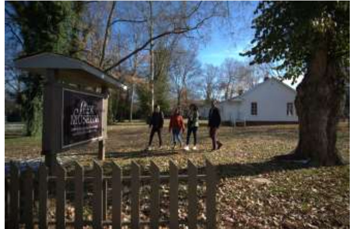
4 historic buildings in the Bottom built between 1810 and 1946

The SEEK MUSEUM tells the unique and important history of slavery in Kentucky, along with the related history of the struggles for freedom, equality and justice. This is told in 6 historic buildings located in two adjoining National Register Districts. Educational exhibits and lesson plans have been developed to encourage our visitors to seek knowledge, truth and understanding of these important issues.