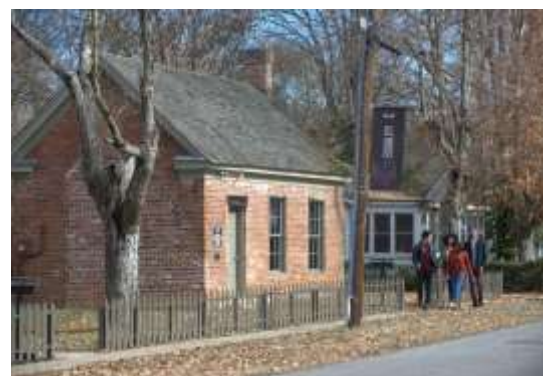
1810 house – site of cultural heritage exhibit