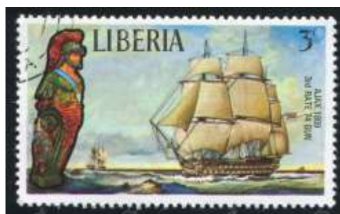
Stamp of the sailing ship "Ajax" that transported Bibb's slaves