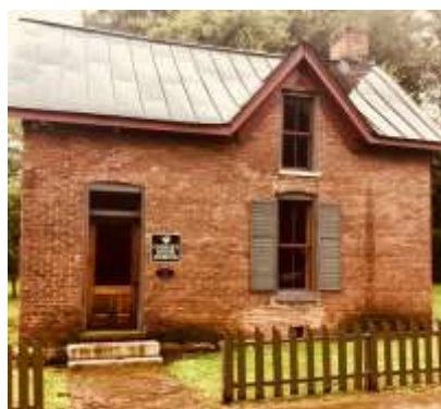
1880 house – site of "By Parties Unknown" exhibit