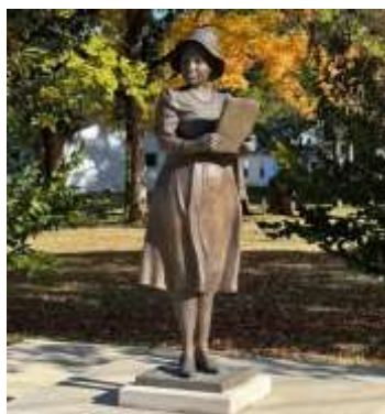
Bronze statue of civil rights pioneer, Alice Allison Dunnigan

The SEEK MUSEUM in the BOTTOM addresses the strength and resilience of the people who developed this neighborhood after the Civil War and who worked for equal rights in the face of legalized segregation and racial intimidation and violence.